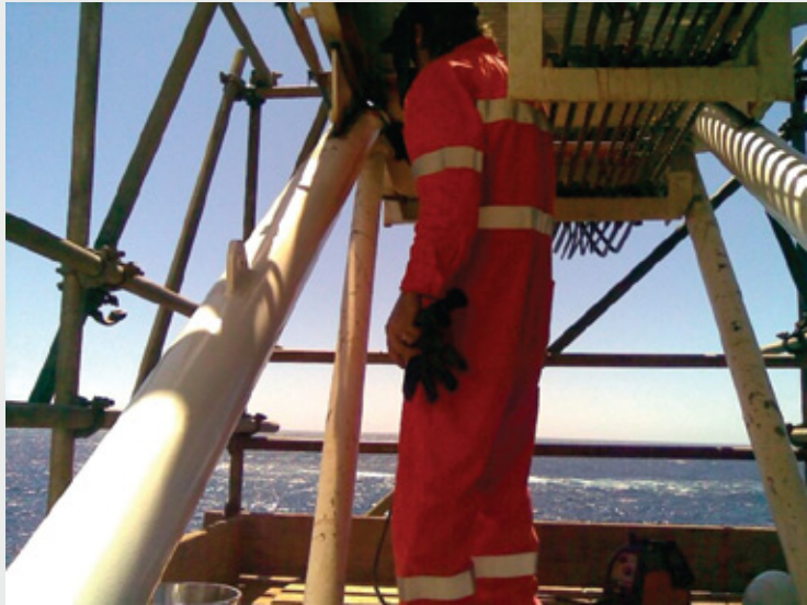
WINNING PHOTO: Welding in an offshore environment.

As part of our safety awareness campaign, LOGIC Services ran a photo competition to encourage the acknowledgement of safe working practices.