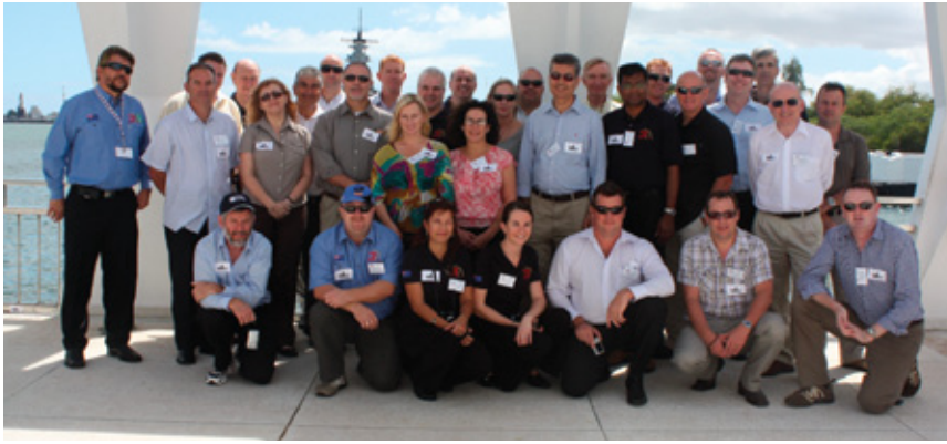
PHOTO: The AmCham delegates in Houston 2010.