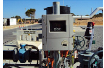
Inlet splitter area flow transmitter