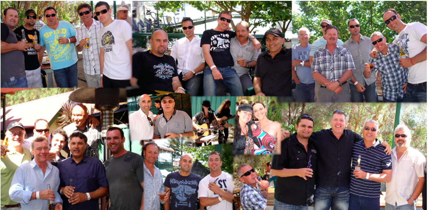
PHOTO: LOGIC Services team members enjoy their summer wind-down party at the Leftbank in Fremantle.